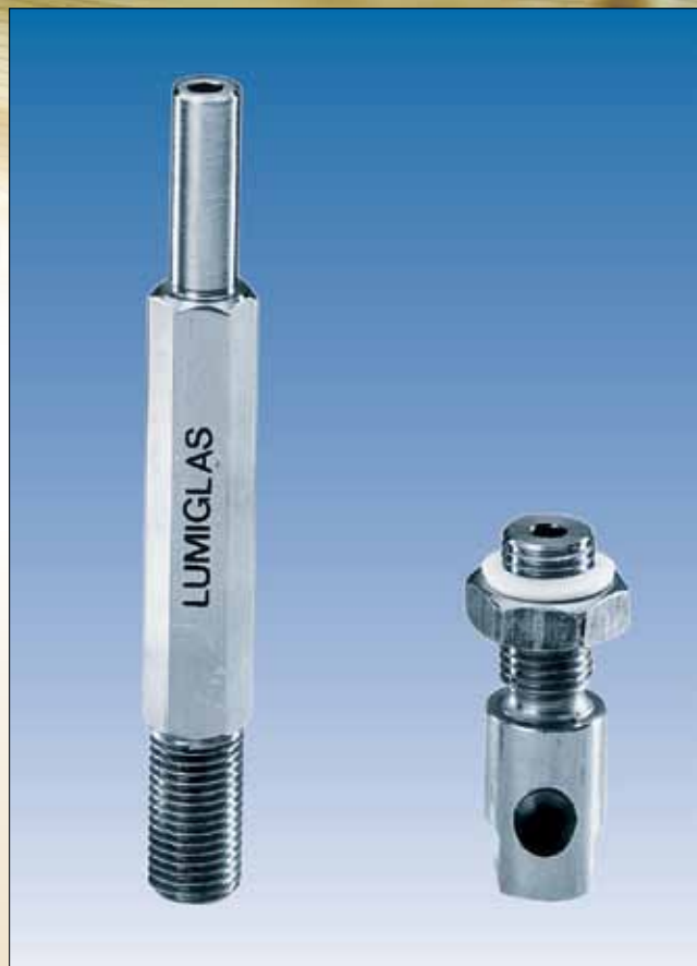
Spray unit and feed nozzle designed for sightglass flanges to DIN 28120.

If ordering as separate item, always state operating parameters as well as details of flange/glass materials and dimensions.