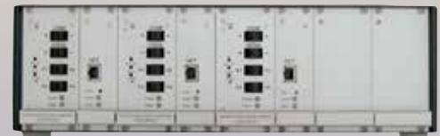
6-camera rack equipped with three camera modules and three video servers