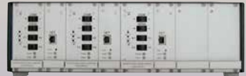
6-camera rack equipped with three camera modules and three video servers