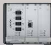
Single-camera rack with video server