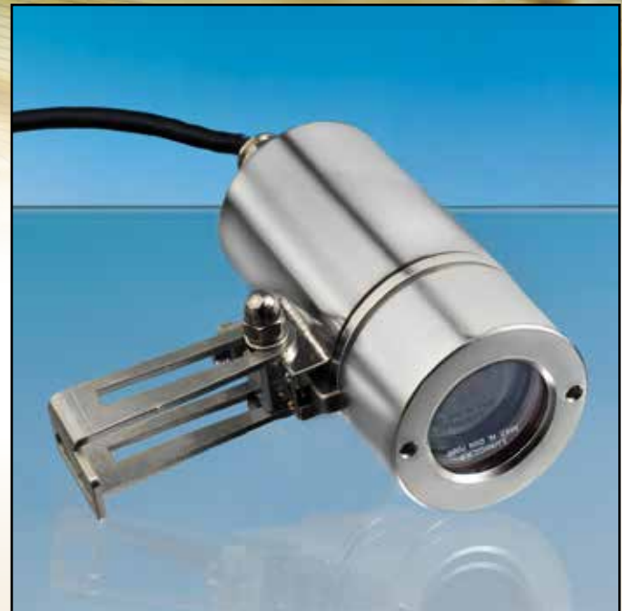
Lumiglas VISULEX K 25-Ex camera with zoom lens