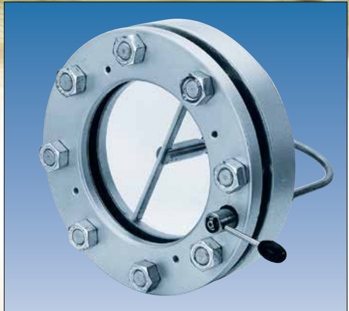
Lumiglas SW II BW mounted into sight glass fitting DIN 28120