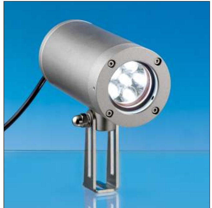
Lumistar luminaire ASL 55-LED-Ex

24 V AC/DC LED 11 W/15 W 120-230 V AC/DC LED 11 W/15 W Protected by 1A miniature fuse. Equipped with 3 or 6 high-power LEDs.