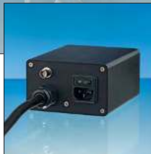
Terminal box for VISULEX camera K55P-Ex