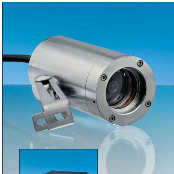
VISULEX camera K55P-Ex with fixed lens