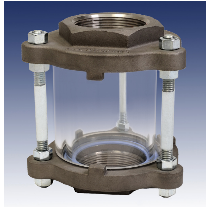
Full View Threaded Visual Flow Indicator