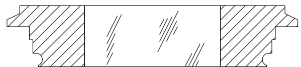
Metaglas® Tuchenhagen Varivent® Fitting

Sight glass discs typically fail because the glass cannot tolerate a particular combination of shock and bending forces they encounter when operating under pressure. When undue stress is applied to conventional glass - both the stress introduced by system pressure or that inadvertently induced during reinstallation after cleaning - the force is concentrated along tensile stress lines. Eventually the lines develop into cracks which can immediately compromise the barrier. Worse, a general pattern of cracking can occur suddenly, either spontaneously or as the result of a slight impact, compromising the physical integrity of the glass. So, when a conventional glass disc fails, it can do so without warning, suddenly shattering into fragments with explosive force.