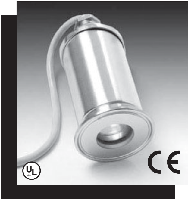
MetaClamp® with Lumiglas® Light