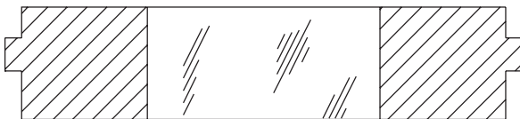
Metaglas® John Perry Fitting