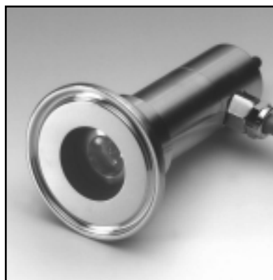
Light port assembly using the Lumiglas Stainless Steel Mini-Luminaire, Series USL 01, with Metaglas Metaclamp.

All dimensions in mm unless stated otherwise. Subject to change without prior notice