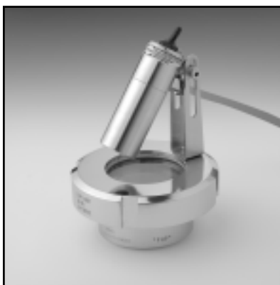
Lighting port assembly, showing Lumiglas Stainless Steel Mini -Luminaire, Series USL 01, with hinged bracket fitted to screwed sightglass (MV 50).