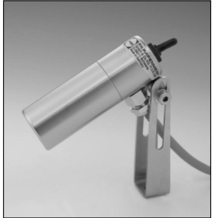
Lumiglas Stainless Steel Mini-Luminaire, Series USL 01 with hinged bracket.