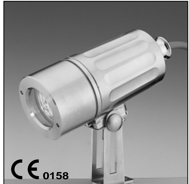
Stainless Steel Lumiglas Luminaire Type ESL 25-Ex 1