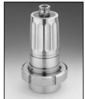
As lighting port, fitted to DN 65, dairy style unit, using adapter flange.