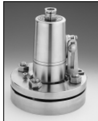
As lighting port, fitted to sight glass style DIN 28120, DN 50.