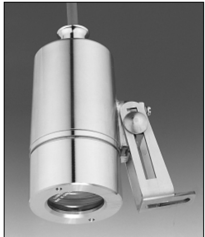
Stainless Steel Lumiglas Luminaire Type ESL 25-Ex with hinged bracket fastening, plain design, polished.