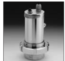
Installed on a Series MV using Adapter Flange