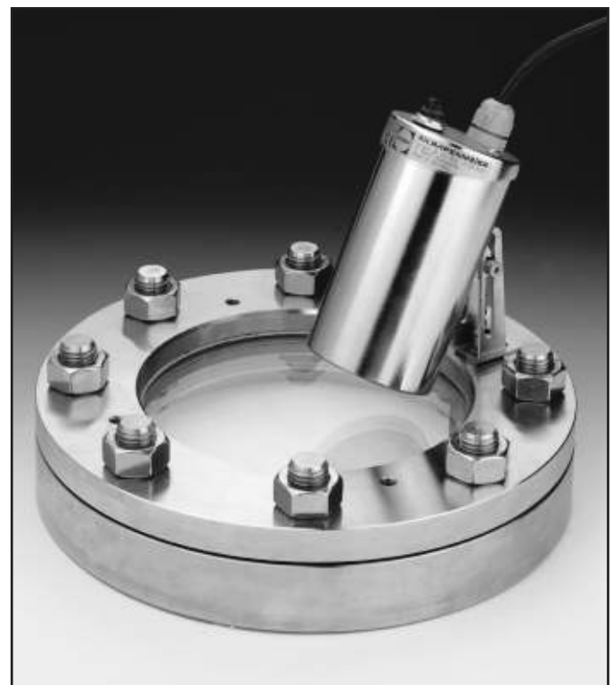
Stainless steel Lumiglas luminaire USL 15 with hinged bracket mounted onto a circular sight glass fitting series DIN 28 120