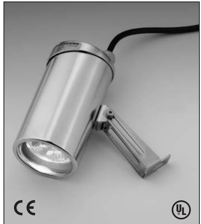
Stainless steel Lumiglas luminaire series USL 15

This light is available with a sanitary clamp connection utilizing MetaClamp ® technology. Specify a USL-35 light.