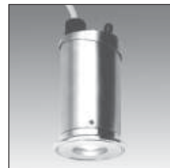
Installed on a Metaclamp® Sanitary Clamp connection size 3".